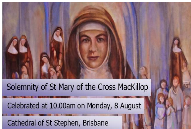
Solemnity of St Mary of the Cross MacKillop

Thursday 4 August, 9am-10.15am at Australian Catholic University, Banyo. To find out more or register: https://app.tickets.org.au/eb/LBSS22_1